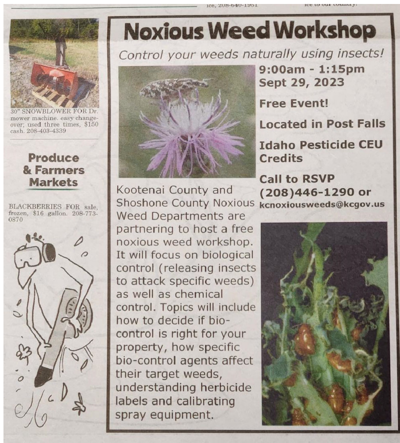
Figure 1: Kootenai/ Shoshone County Noxious Weed Workshop advertisement from the 9-8-2023 edition of the Nickel's Worth.